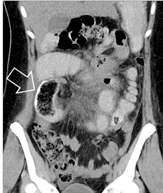
Figure 2. Abdominal CT with intraluminal contrast revealed a marked distention of the proximal jejunal loops, as well as a blindly terminating loop of the small bowel within the right medium abdomen with a diameter of up to 5 cm, containing an obscure mass with the mixed liquid and air bubbles contents, surrounded by heterogeneous high-density walls (arrow). Retrospectively, this finding represents an intraluminal migrated gauze sponge coated with barium.

about 100 cm from Treitz ligament. When separating the adhesions, the intestine was opened and a foreign body (a crumpled surgical sponge 9x4x4 cm) was removed from the lumen ( Fig. 3 ). After partial resection of the damaged segment, intestinal continuity was restored by an end-to-end anastomosis. Postoperative histopathological examination of the resected bowel revealed the presence of macrophage granulomas with giant cells of “foreign body” type ( Fig. 4 ). Anemia was compensated by the transfusion of 3 units of red blood cells. The patient had an uneventful recovery and was discharged 12 days after the intervention. After a year of follow-up, the patient had no symptoms.