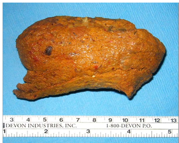
Figure 3. A crumpled retained surgical sponge 9x4x4 cm, spontaneously migrated into the lumen of the jejunum and caused mechanical intestinal obstruction

objects after surgery is difficult to estimate, but it has been reported to be about 1 in 3000 intraabdominal procedures (6). However, it is