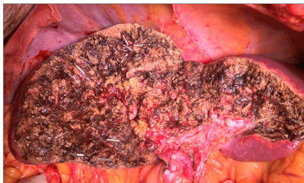
Figure 2. Central hepatectomy for liver metastases from colon cancer