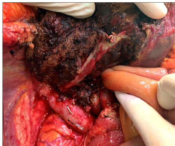
Figure 3. Right extended hepatectomy with portal vein resection

There were 2 patients with Klatskin IIIA with