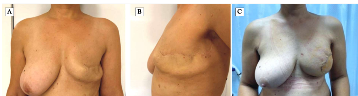
Figure 1. Patient with left mastectomy. (A,B) Post-mastectomy photos. (C) Outcome after breast reconstruction with latissimus dorsi flap and implant presented one month postoperatively

Delay breast reconstruction with implants was used for 7 patients, 8 to 24 months after mastectomy. Hospital stay varied from 5 to 10 days. The length of postoperative hospitalization was 10 to 12 days for patients with DIEP